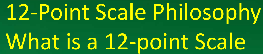
12-Point Scale Percentage Spread